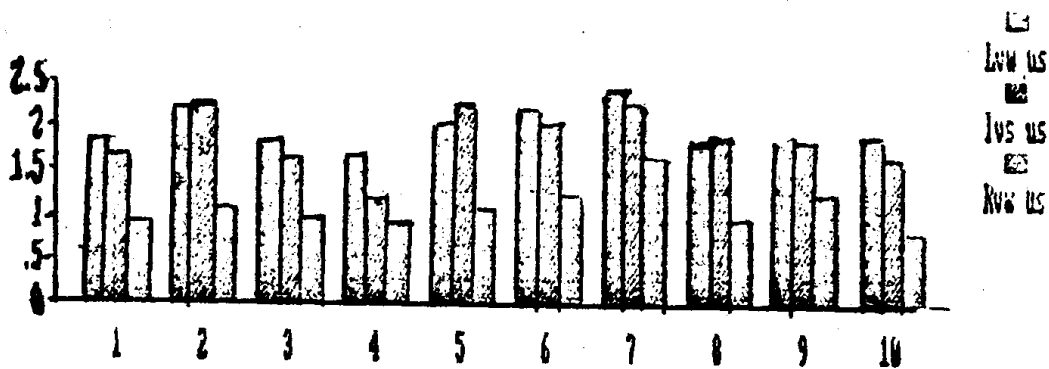
Fig. (2): Bar graph showing relationship of the left ventricular wall thickness (LVS US) and right ventricular wall thickness (RVW US) of the heart of 10 adult sheep, as measured ultrasonographically in cm.